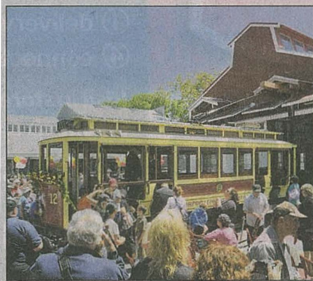
POTENTIAL: The riverboat museum and tramshed could become part of a vintage transport complex.

'what's next?'. We believe the transport centre will build on that by offering another visitor option and a ride in a vintage car taking in other sights around the city."